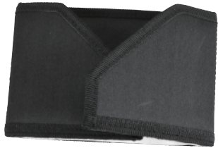
Outdoor Screen Shroud